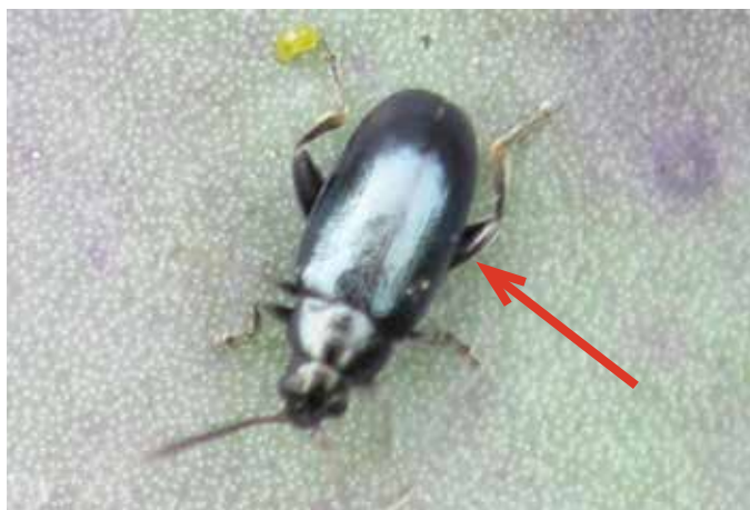
Fig. 1. Flea beetles have enlarged femoral hind legs and jump when disturbed.

Flea beetles are common and problematic in Utah. They are present in late spring and early summer on many vegetable crops and ornamental plants. Adult flea beetles are small, shiny insects that have enlarged hind legs, allowing them to jump great distances when disturbed (Fig 1). They are strong fliers, moving into crops from neighboring fields and weedy borders.