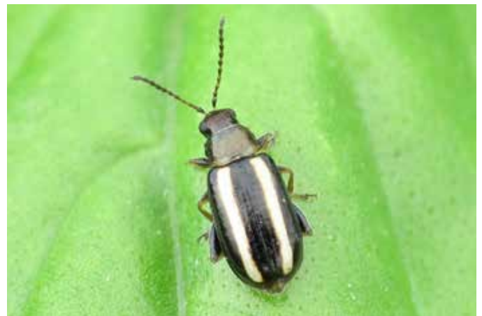
Palestriped flea beetle ( Sestena blanda ) is not only one of the most widely distributed flea beetles of North America, but also has the broadest host range. The palestriped flea beetle is one of the larger species (1/8 inch long).