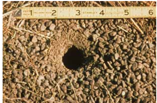
Fig. 5. Common yellowjacket nest opening. 1