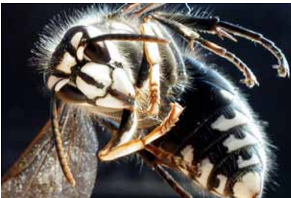
Fig. 8. Baldfaced hornet.

Nests that are high in the trees should be left alone. Nest removal should be considered when located near human activity. In general, removing small nests in the spring is easier than moving full-size nests in the late summer. Chemical control of hornets is potentially dangerous and should be carefully considered. Wear long-sleeved shirts and pants and avoid holding a flashlight directly at the nest. The most effective control is achieved by applying insecticide directly into the nest opening at dusk (when most colony members are in the nest). Some insecticides are pressurized and can be applied up to 20 feet away from the nest. After an application, quickly move away from the nest. Do not attempt to burn a hornet nest because it is extremely hazardous and environmentally unsound.