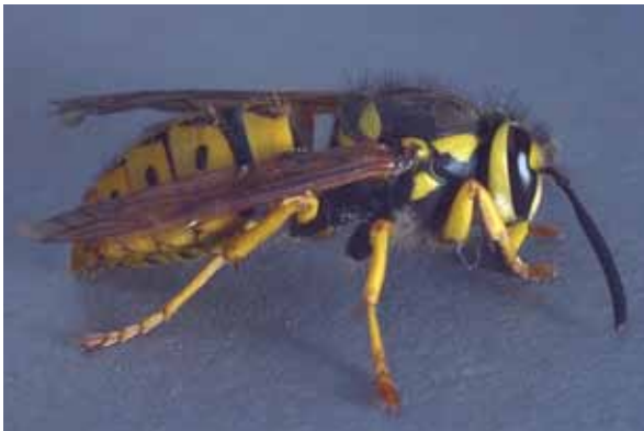
Fig. 4. Western yellowjacket. 1

Always try to avoid unnecessary stings, especially if family members are allergic, by minimizing potential contact with yellowjackets. Cover or eliminate garbage and other food sources. Never swing or strike at yellowjackets since quick movements often provoke attack and painful stings. Take care not to disturb underground nests when maintaining the lawn if possible. Never throw rocks or spray water into nests or attempt to burn nests. These actions could initiate a stinging swarm or cause unforeseen damage to the property.