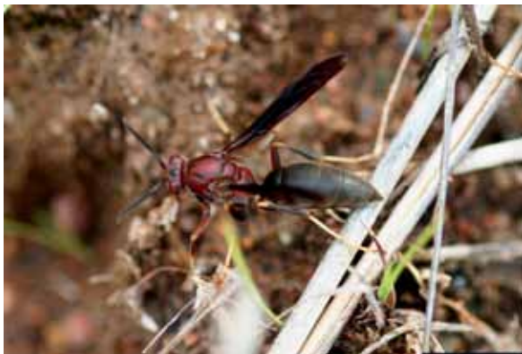
Fig. 14. Paper wasp. 1