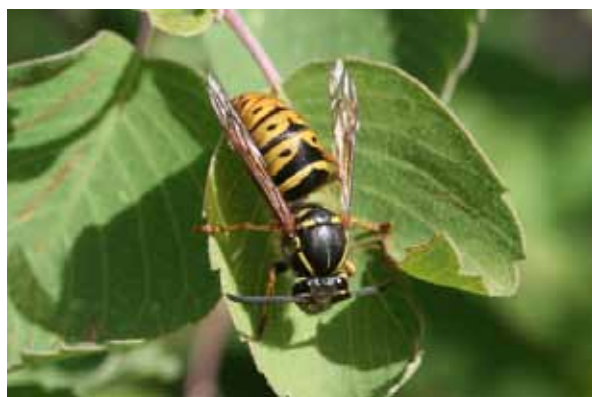
Fig. 1. Yellowjacket. 1

Social wasps, including yellowjackets, hornets and paper wasps, are common stinging insects in Utah (Figs. 1, 2). The wasps are related to ants and bees, which are also capable of stinging; however, yellowjackets are the most likely to sting. Less than 1% of people are allergic to wasp or bee stings; however, some people are fatally stung every year. Nearly 80% of all serious venom-related deaths occur within one hour of the sting. Most people will only experience a mild local reaction with redness, pain, swelling and itching at the sting site. If symptoms are more serious, a physician should be consulted. Some people may develop venom sensitivity after repeated stinging episodes over a short or long period of time.