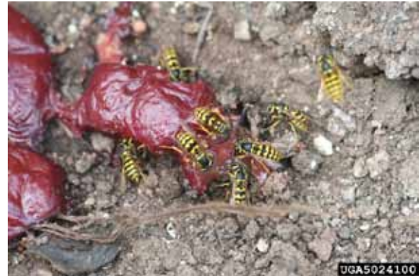
Fig. 7. Example of scavenging yellowjackets. 1