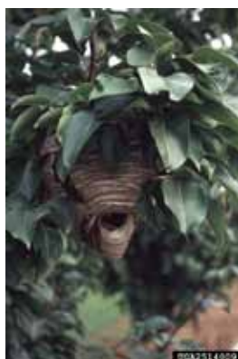
Figs. 10 and 11. Examples of hornet nests. 1,3