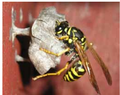
Fig. 13. European paper wasp starting a nest. 4

Removing paper wasp nests is not necessary unless they are near human activity. Repairing foundation cracks and sealing holes will deter queens from starting a new colony. Reducing queens and small nests early in the spring will prevent large colonies from building up.