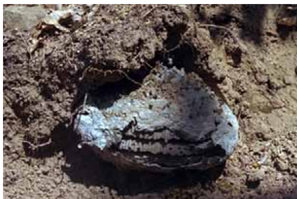
Fig. 6. Underground yellowjacket nest revealed. 1