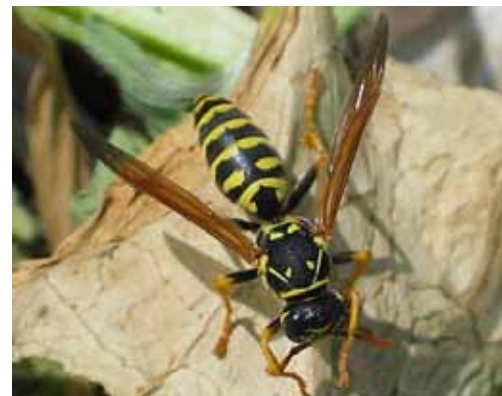
Fig. 15. Paper wasp. 5