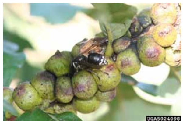
Fig. 12. Example of hornets scavenging fruit. 1