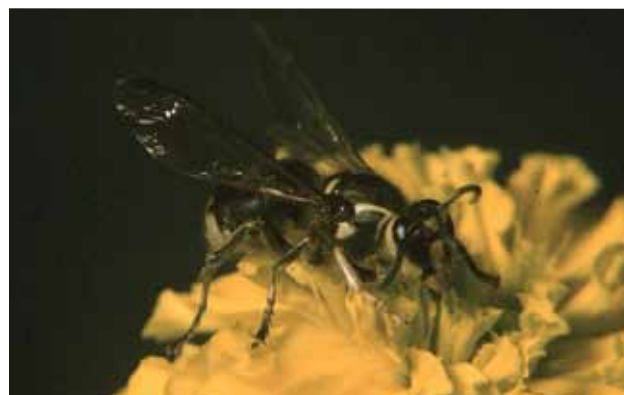
Fig. 2. Baldfaced hornet. 2