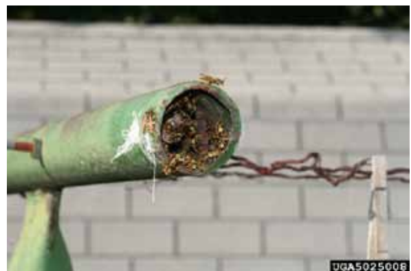
Fig. 17. Example of a paper wasp nest. 1