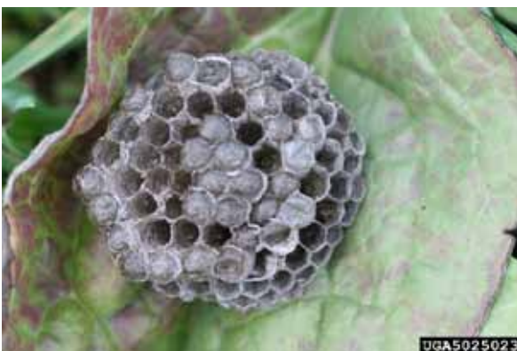
Fig. 16. Example of a Western paper wasp nest. 1