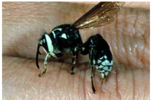
Fig. 9. Baldfaced hornet. 1