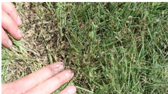
Fig. 1. Billbug feeding will cause the crown to turn brown and die. 1

B illbugs can be a serious turfgrass pest throughout the entire U.S., with at least eight species known to occur. In Utah, two species have been detected (Denver and bluegrass billbugs) and reported to cause turfgrass damage (Fig. 1). Although not a new pest to turfgrass, billbugs are often ignored or misdiagnosed, and root decline is confused with drought stress, fungal disease, or other insects. In most cases, damage is diagnosed as dollar spot disease or white grub feeding. Sod farms and golf courses seem to be especially affected by billbugs because turfgrass is well maintained. Newly-laid sod should be carefully monitored for the presence of billbugs.