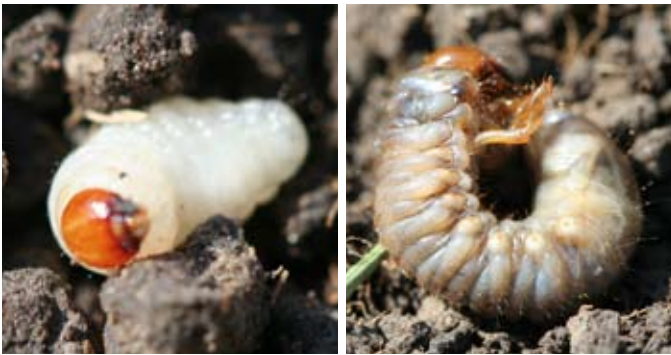
Figs. 4 and 5. Examples of a common billbug (left) and white grub (right). 1

Although in different beetle families, billbugs sometimes can be confused with white grubs. There are a few common characters that distinguish the larvae. Billbugs are legless, have cream-colored bodies with a brown head, and have a slight curve to the body; larvae look like a grain of puffed rice (Fig. 4). By comparison, white grubs have three pairs of legs, have dirty grey-colored bodies with a brown head, and have a C-shaped curve to the body (Fig. 5). Full grown billbugs can reach up to ½" in length while white grubs can reach 1". While both types of larvae feed on turfgrass roots, white grubs are generally feeding well below the thatch layer.