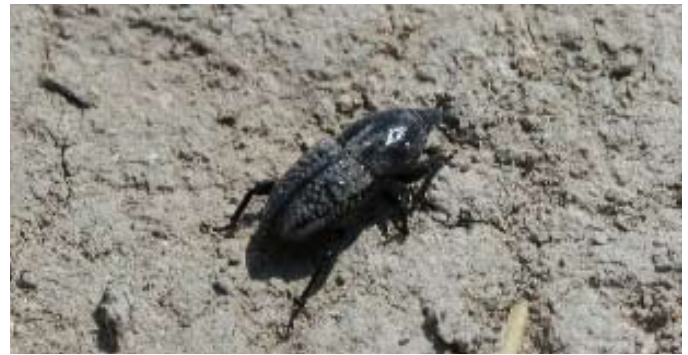
Fig. 6. Adult billbugs can be seen walking from sheltered areas to turfgrass in the spring. 1

Billbugs typically have one generation per year. Hunting and bluegrass billbugs overwinter in the adult stage and Denver billbugs can overwinter as adults or as full-grown larvae. When temperatures begin to warm in the spring, adults become active again and move from sheltered areas to turfgrass (Fig. 6). Mated females lay eggs in plant stems near the crown. Young larvae feed on grass blades near the crown, but will eventually move just below the thatch layer to feed on roots. Larvae feed until mid-July and pupate within the soil. Adults emerge in late July and are active in turfgrass for a few weeks before moving to sheltered areas for the winter.