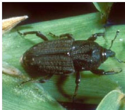
Fig. 8. Hunting billbug. 3