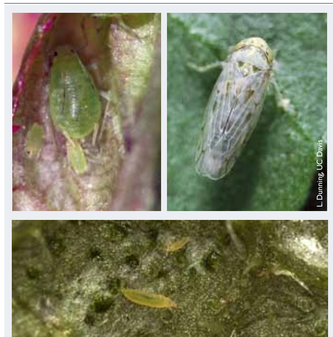
Green peach aphid ( left ) can vector several virus diseases, the beet leafhopper ( right ) vectors Beet Curly Top virus in tomato and pepper, and the tiny thrips ( bottom ) vectors Iris Yellow Spot virus or Tomato Spotted Wilt virus, depending on species.

The beet leafhopper vectors Beet Curly Top virus which is primarily a problem in tomato and pepper in Utah; how-