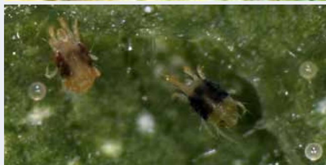
The Stethorus lady beetle (aka the spider mite destroyer, top ) is one of many important mite predators. Both the small adult (left) and larva (right) are predators of spider mites ( bottom ).

foliage from dirt roads, which benefits pest mites and hinders predators, should be kept to a minimum by washing plants or altering the road surface.