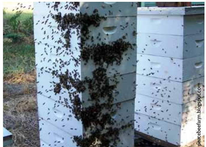
Top: Honey bees cool the hive by “bearding,” which makes more room within the hive and increases air circulation.