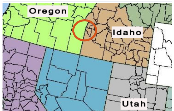
Circled area is where elm seed bugs have been confirmed.