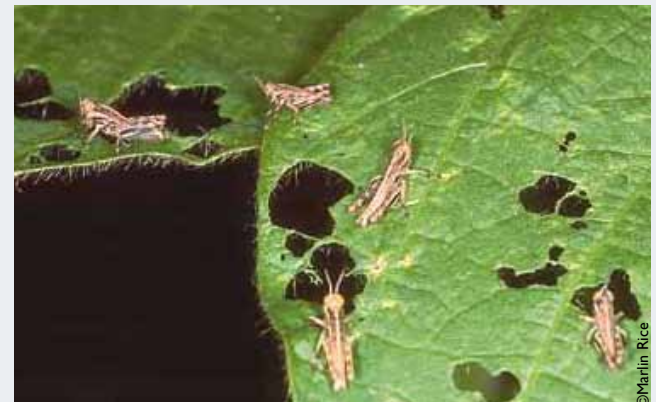
Top: Differential grasshopper nymph.