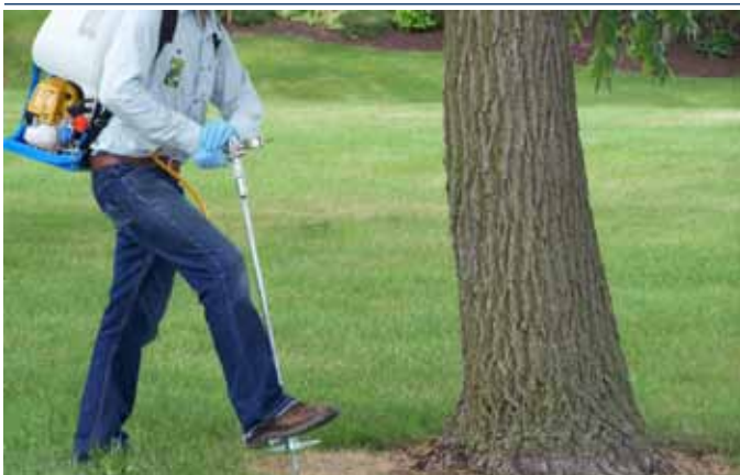
Soil injection system involves injecting chemicals 2 to 4 inches deep.

Soil injection methods typically involve injecting chemicals 2 to 4 inches deep with a high pressure injector either within 18 inches of the trunk or on a grid. The amount to be applied depends on trunk diameter, with additional trunk diameters