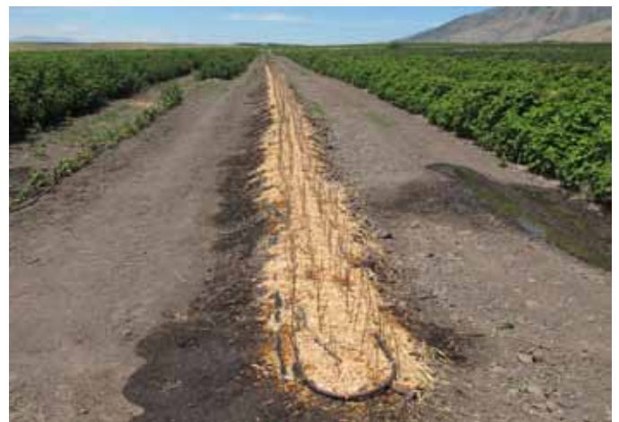
Merv Weeks of Weeks Berries of Paradise has planted 26 acres of new raspberries ( top ) and propagates new plants on-site ( bottom ).

Blueberries in Utah? Everyone knows that they are nearly impossible to grow in alkaline soils, but that didn't stop the inventive Weeks, who in 2005, grew the first commercial crop in the state. The blueberries get special pampering of about a dozen practices to keep them thriving, including trellises and raised beds, wood chips and bark mulch, sulfur applications, netting to keep the birds out, and winter protection. In spite of that, Weeks wants to increase the crop. "In a good year, we harvest 500-700 cases of blueberries, with Duke being especially productive and tasty. My sons ask me why we bother with them, but managing them is a learning curve, and I tell them that some year we'll reach 2,000 cases and it will all be worth it."