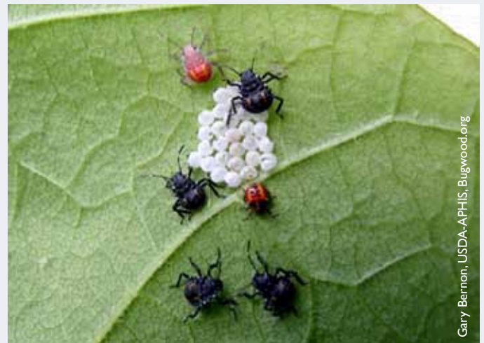
Top: Identifying features of adult brown marmorated stink bug.