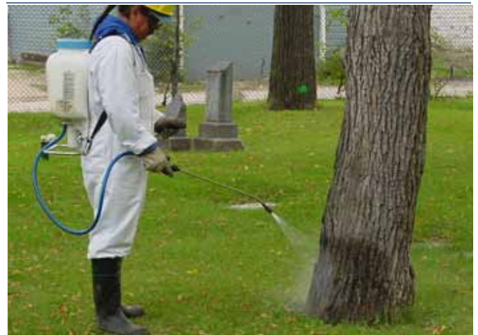
Trunk basal sprays saturate the lower 5 feet of the trunk.

Trunk basal sprays involve spraying, but the chemical is applied to the trunk base and is absorbed through the bark and then taken up in the vascular system. The chemical is sprayed on the lower five feet of a dry trunk, saturating the bark.