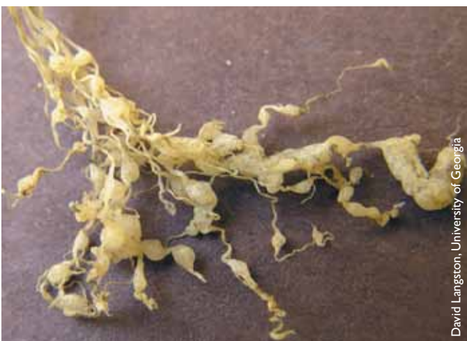
David Langston, University of Georgia

Above-ground symptoms of infection with root-knot nematodes often resemble symptoms of nutrient deficiency. Plants are yellow, small, stunted and wilt easily. Roots of affected plants often have galls. The galls, which contain the female nematodes, form due to hormones released by the females. The plants will transport more nutrients to the galls, providing more nutrition to the nematode. On root crops like carrots, the nematodes can cause forking and galls on the carrot.