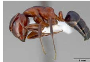
Fig. 13. C. hyatti . 1