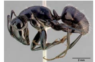
Fig. 14. C. laevigatus . 1