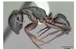
Fig. 19. C. nearcticus . 1