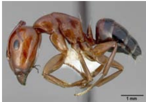
Fig. 11. C. essigi . 1