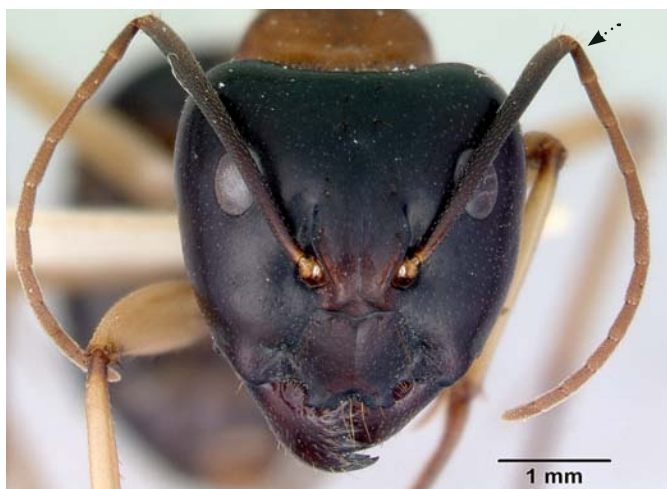
Fig. 1. Front view of a worker carpenter ant head ( Camponotus perthiana ). 1 The arrow indicates the elbowed antennae of ants.