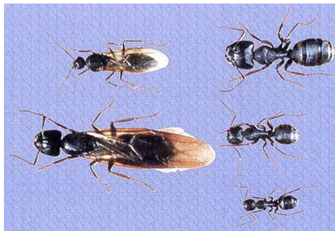
Fig. 2. Polymorphism (different body types) in carpenter ants. 2 Top left: winged reproductive male; bottom left: winged reproductive queen; right: different sizes of worker ants within the same colony.

All aspects of carpenter ants are not negative. Most play vital roles in maintaining a healthy environment. Carpenter ants are voracious predators in the forest ecosystem. They often consume large prey including stink bugs, leaf beetles, and spittle bugs. They also scavenge on dead insects, and prefer sweet foods such as honeydew from aphids, or sugars from fruits. Ants help speed the decomposition of wood by perforating wood cells allowing moisture and other wood decaying organisms to invade. Ants are also a food source for many birds and animals.