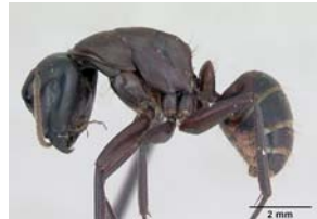
Fig. 12. C. hurculeanus . 1