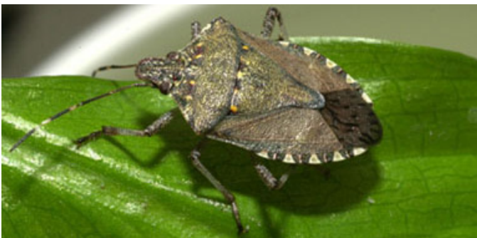
Fig. 1. Adults are shield-shaped, brown, and 5/8 inch long. 1

B rown marmorated stink bug (Order Hemiptera: Family Pentatomidae) (BMSB) (Fig. 1) was accidentally introduced into the eastern U.S. from Asia in the late 1990s. In 2001 it was officially identified in Pennsylvania, and has since spread along the eastern seaboard and westward into the Great Lakes region. In 2002 it was found in Portland, Oregon, and has since spread to localized areas in Washington and California. It has not yet been found in Utah, but it is likely only a matter of time before it will occur in most states due to its rapid adaptation to a wide range of climates. Since 2004, BMSB has gained notoriety as a major nuisance due to large aggregations of the bugs invading buildings in the fall to overwinter, attracted to the protective warmth.