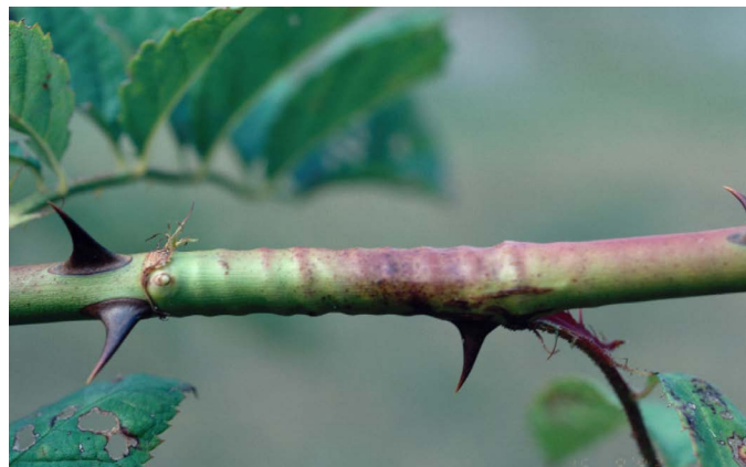
Fig. 4. A multiflora rose cane showing spiral grooves caused by girdling of a rose stem girdler larva 4 .

Prune out and destroy infested canes in spring through summer to remove larvae. Prune below the point of insect boring activity, or remove entire canes. Second-year canes generally wilt before harvest and should be removed at that time. Infested canes should be destroyed by burning, composting, or burying in soil at least 2 inches deep to prevent adults from emerging. If an infestation is substantial, pruning should be supplemented with chemical control.