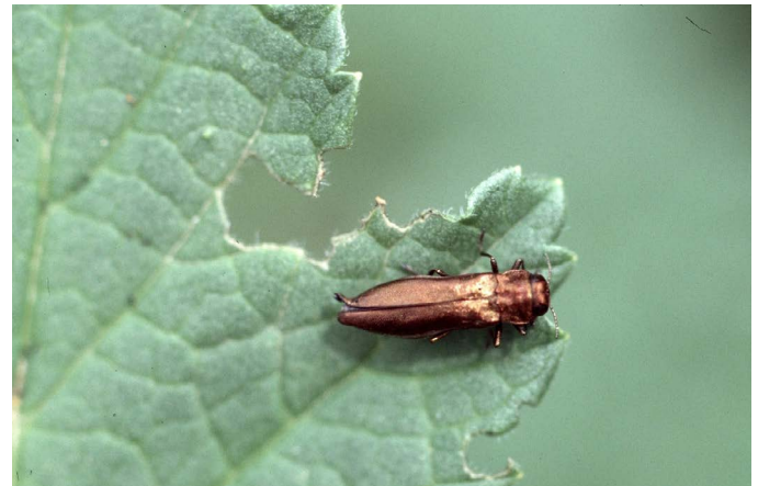
Fig. 1. The rose stem girdler adult is a small, metallic-copper flatheaded beetle. Note the chewing injury to edges of the raspberry leaf 1 .