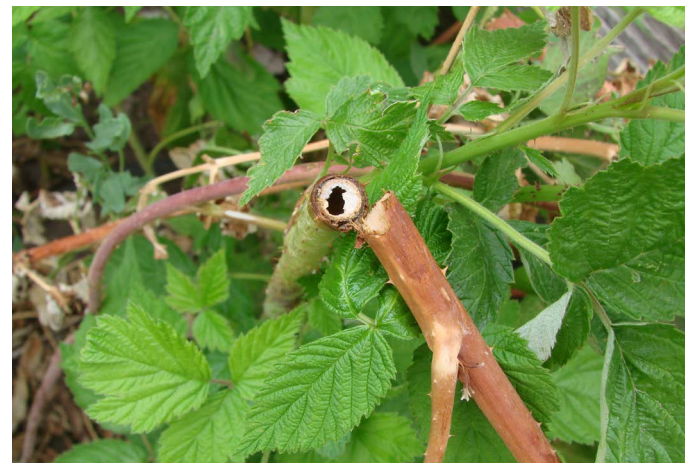
Fig. 2. A raspberry cane with damage from tunneling by a rose stem girdler larva. The cane broke at the girdling site 2 .

The rose stem girdler is a small flat-headed, metallic beetle ( Coleoptera ) in the Family Buprestidae (Fig. 1). It was first introduced into the eastern U.S. from Europe in the early 1900s in infested roses. It was first reported in Utah in American Fork in 1955. Today, it is a common cane-boring pest of raspberry, blackberry, and wild rose in central and northern regions of the state. It has been observed in Rich, Cache, Box Elder, Weber, Davis, Salt Lake, Utah, Wasatch, and Sanpete counties. Larvae tunnel in the canes causing gall-like swellings and cane breakage (Fig. 2). The rose stem girdler can dramatically reduce stands of red raspberry canes, and even kill out a planting.