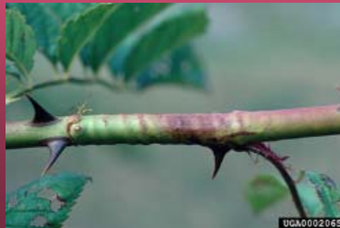
Spiral grooves in cane