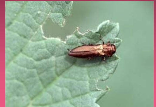
Adult rose stem girdler