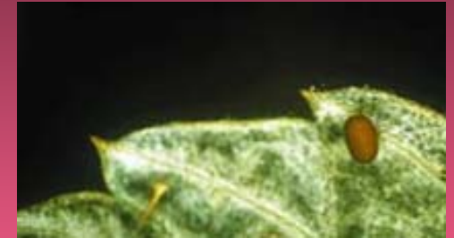
Egg laid on leaf