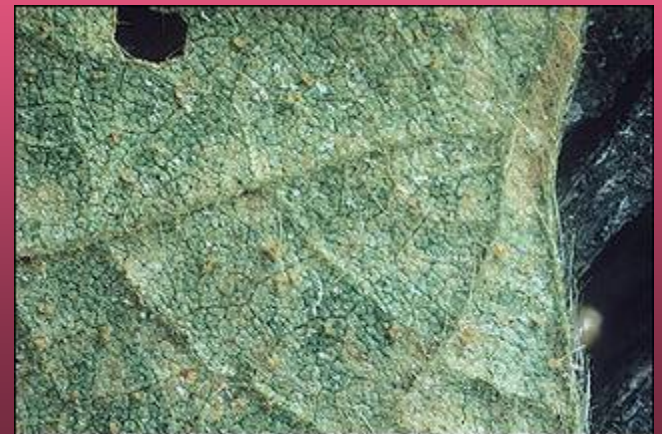
Leaf with mite webbing