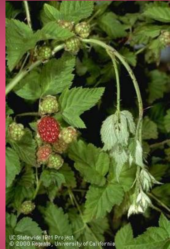
UC Statewide IPM Project © 2000 Regents, University of California