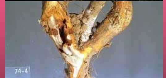
Crown borer larvae tunnel in crowns & upper roots