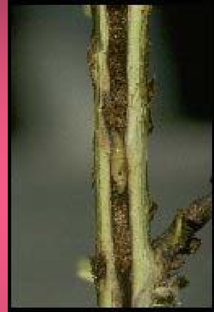
Flatheaded larva tunneling in cane pith