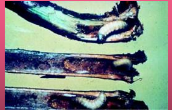
Target young larvae before they start substantial boring