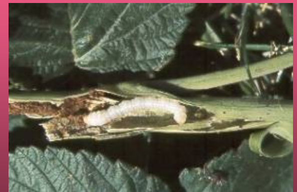
Raspberry horntail larva tunnels in pith