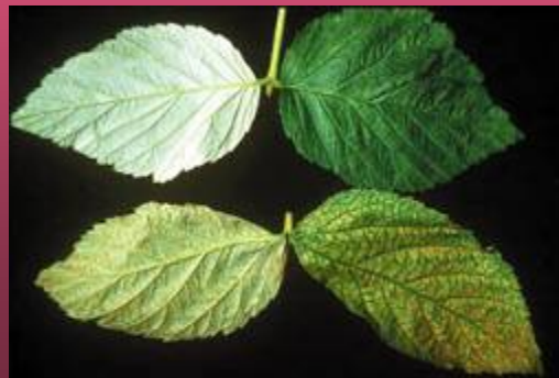
Russeting, brown spots