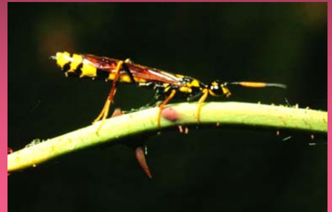
Raspberry horntail female (1/2 - 3/4" long)