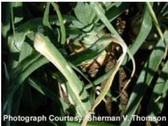
Figure 4. Infected onion plants falling over where lesions are present.

(enveloped tripartite RNA genome). The nature of their enveloping proteins allow Tospoviruses to be effectively vectored by Thrips. The onion thrips ( Thrips tabaci ) is the only thrips species capable of vectoring IYSV, whereas both onion thrips and western flower thrips ( Frankliniella occidentalis ) can vector TSWV and INSV. Studies are currently investigating the IYSV pathway within thrips to determine whether the virus is harbored within the salivary glands or gut of onion thrips or if transmission is simply mechanical.