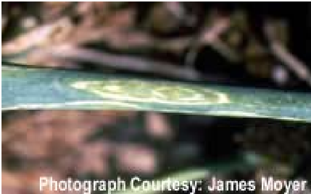
Figure 2. Close up of IYSV lesion on onion bulb leaf. Lesions on bulb leaves tend to be eyespot shaped.