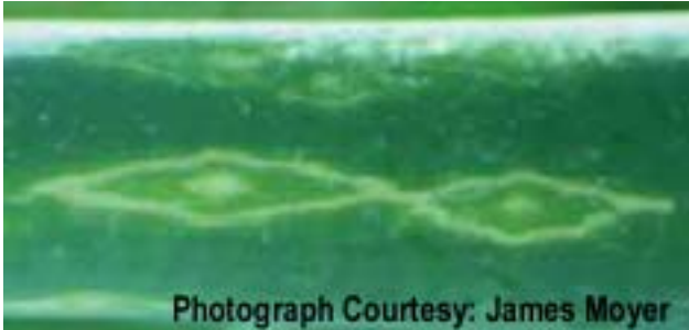
Figure 3. Close up of IYSV lesion on onion seed stalk (scape). Lesions on the scape tend to be diamond shaped.