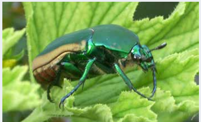
The adult green fruit beetle will sometimes feed on the skin of soft fruits such as tomatoes, peach, and plum, but is usually not a pest of concern.