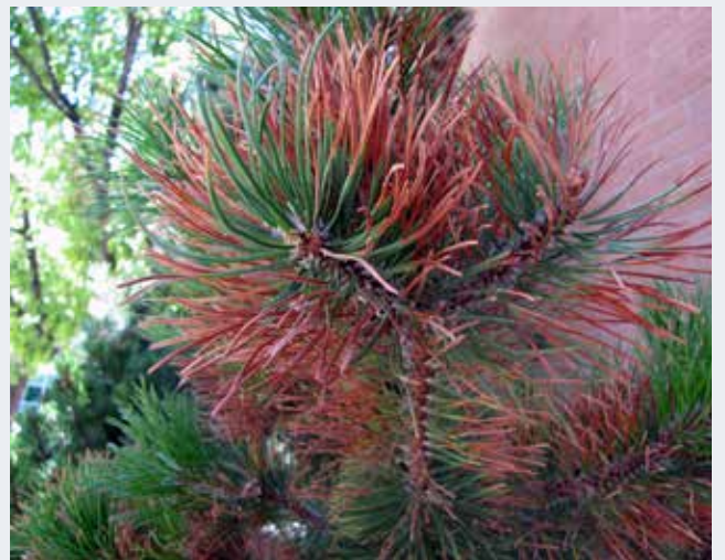
Ozone injury to conifers causes small chlorotic spots on needles ( top ). Spruce and pines affected by winter dessication will have needles that are uniformly necrotic (brown) from the top down ( bottom ).

(similar to winter dessication) and banding (necrotic areas in the middle of the needle). In spruces, foliage will take on a purplish tinge.