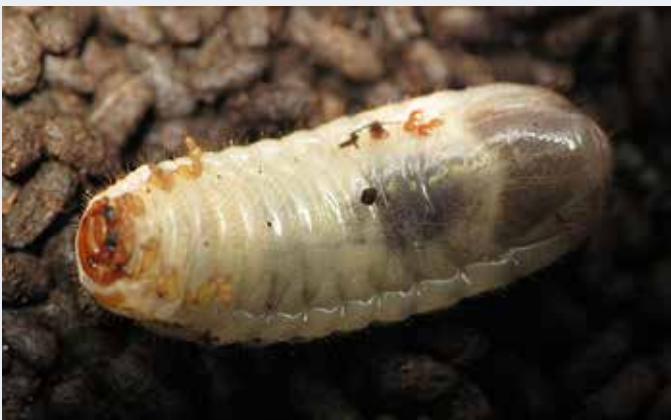
Larvae of the green fruit beetle are large grubs, and crawl on their backs instead of their legs. They help to decompose organic matter, and will not feed on live plants.