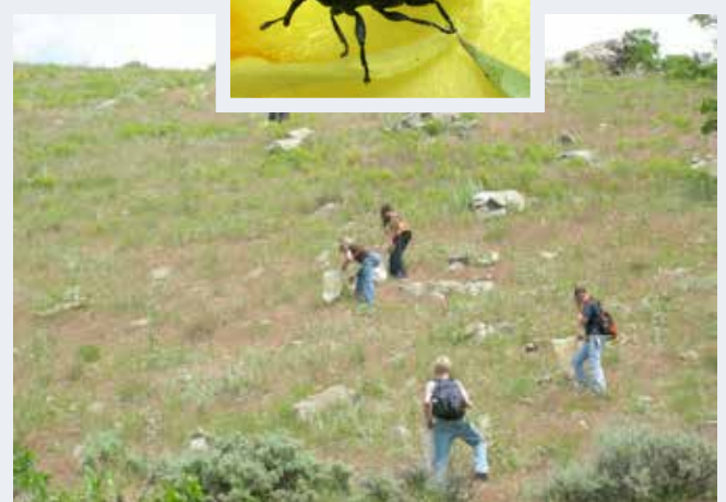
High school science students were involved in helping to collect and release Mecinus janthinus weevils (inset) as biocontrol agents to manage Dalmatian toadflax.