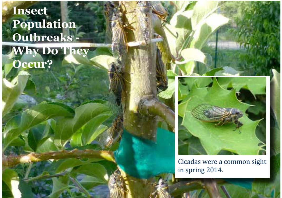
Cicadas were a common sight in spring 2014.

Spring and early summer of 2014 have been a season for high populations of some insects. Miller moths (army cutworms) flooded the Wasatch Front of northern Utah in record high numbers, a large emergence of cicadas wreaked havoc in fruit orchards, and large populations of Ips bark beetles continue to infest and kill landscape conifer trees. The Great Basin and desert landscapes of Utah are well known for their extreme environments and cycles of grasshopper and Mormon cricket outbreaks, but why do these insect outbreaks occur?