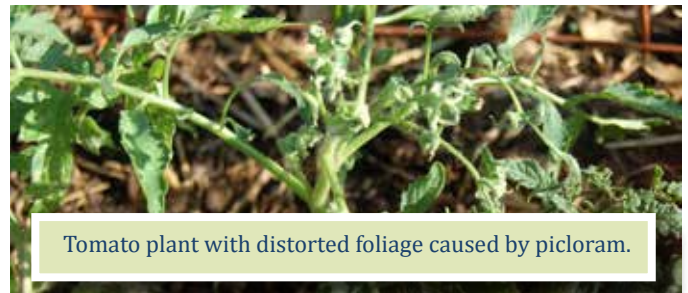
Tomato plant with distorted foliage caused by picloram.

UTAH PESTS people and programs are supported by: