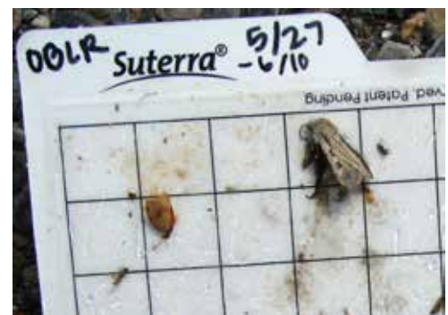
"Miller moths", or army cutworms, were commonly found in our orchard monitoring traps.

Late winter 2014 brought mild temperatures and rainfall, rather than snow, to the valleys of northern Utah. Southern Utah experienced a low-moisture winter and soils had little snow cover. A significant number of heat units (base 50°F) accumulated in the late winter and early